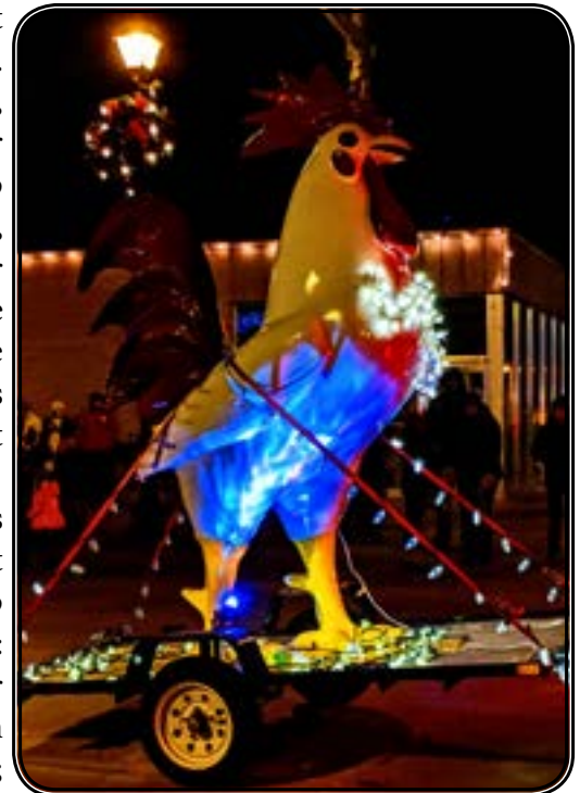
The Wayne Ambassadors represented the Chicken Show in the Parade of Lights.

Anxiety and opportunity are as much a part of economic